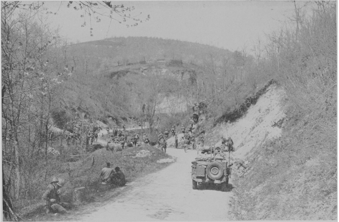
A scene on the Tole road as the enemy begins to fall back before IV Corps