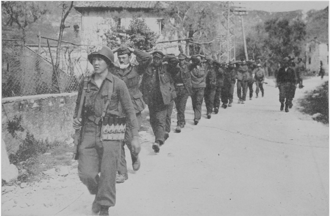
The first German prisoners in the coastal drive come down from the hills