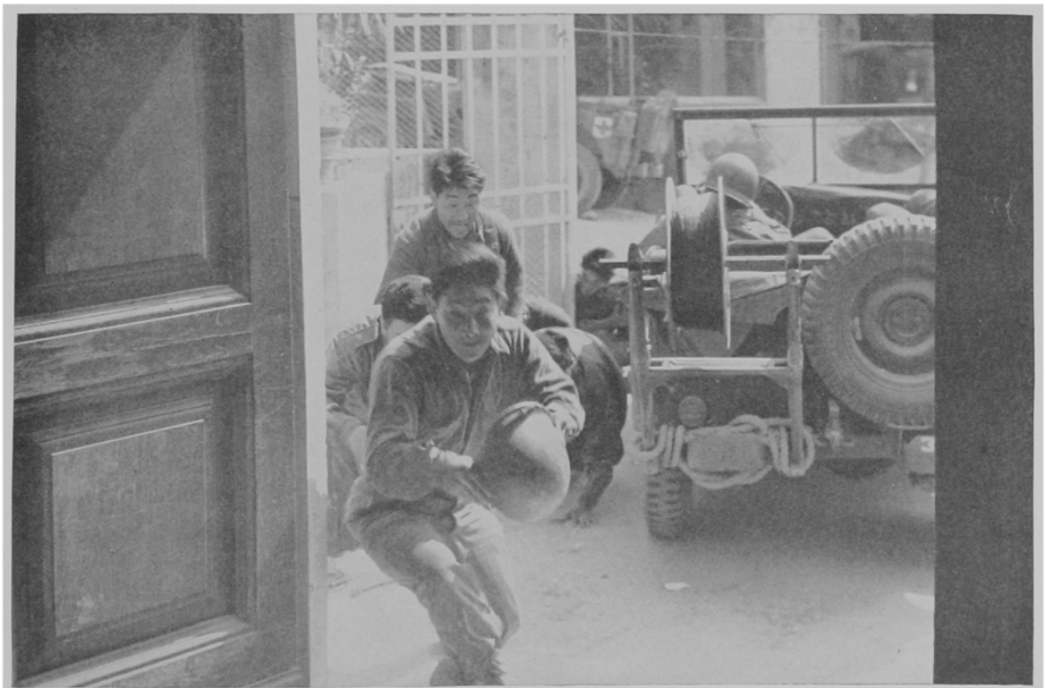
Men of 44 2 d Infantry run for cover from a German shell about to land