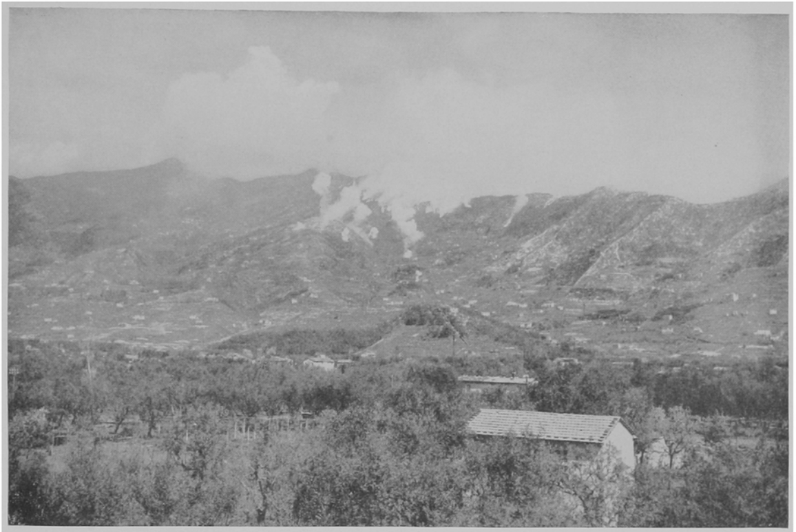
White phosphorus paves the way for our attack in the Strettoia hills