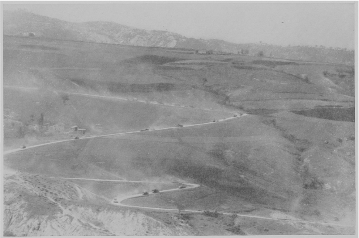
Tanks and trucks send up a cloud of dust as they climb near Montepastore