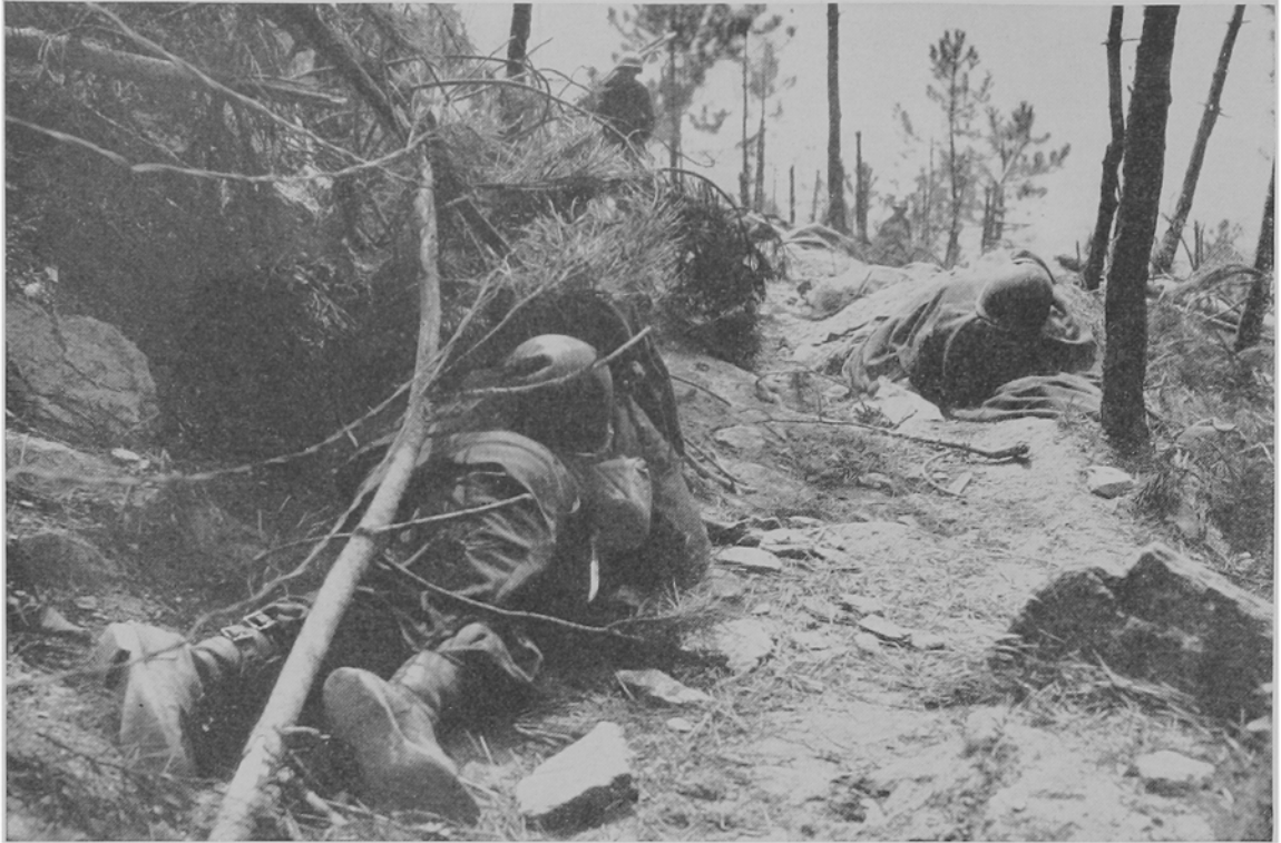
Six men died here, close to Seravezza, when a German mortar shell came in