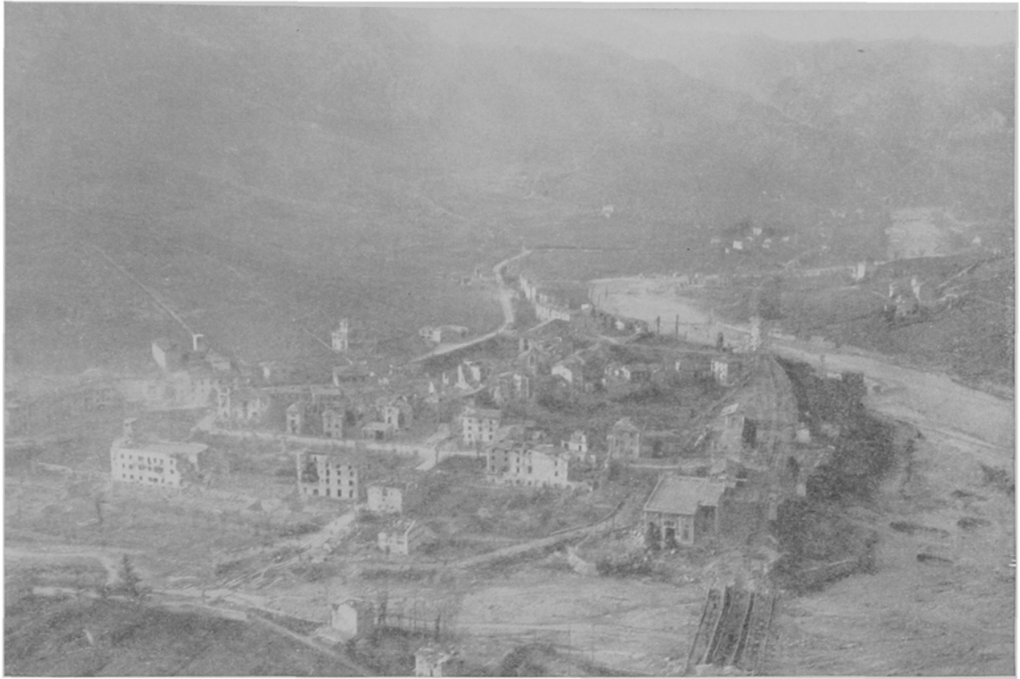
The town of Vergato, a German bastion on Highway 64 overlooking the Reno