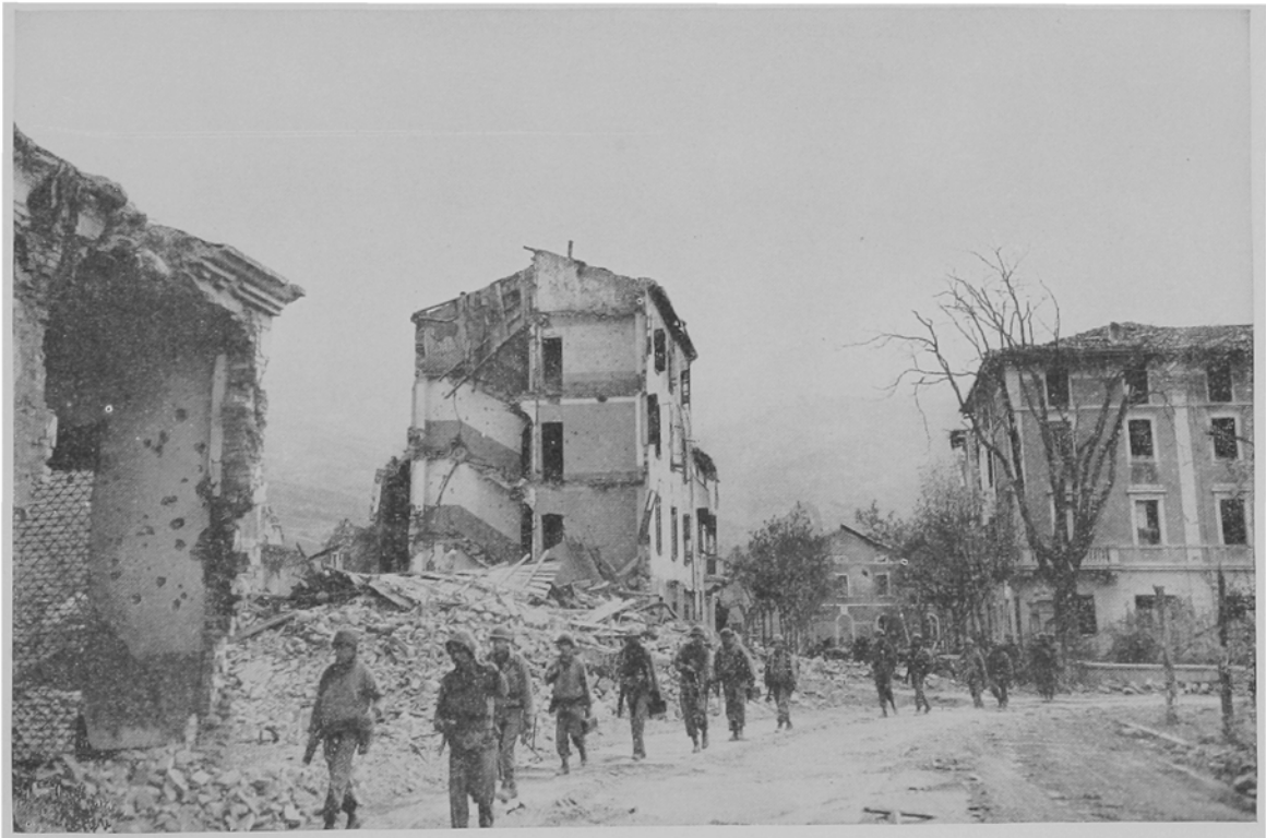
Men of the 81st Reconnaissance Squadron move through the ruins of Vergato