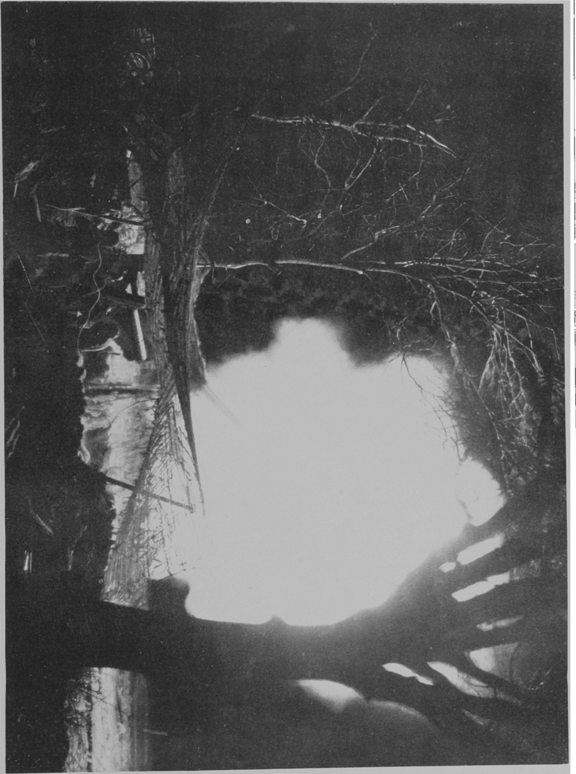
A Long Tom of the 36th Field Artillery fires a mission at night on the Cassino front.