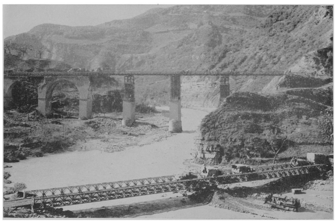
Construction of this Bailey bridge eased supply problems for 13 Corps