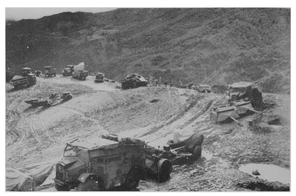
British artillery plows through mud and water on the 13 Corps front