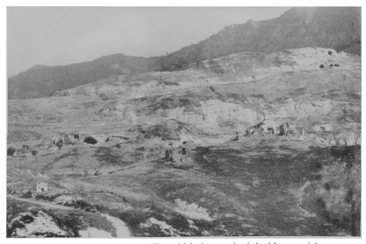
Close-up view of caves and gullies which characterized the Monterumici area