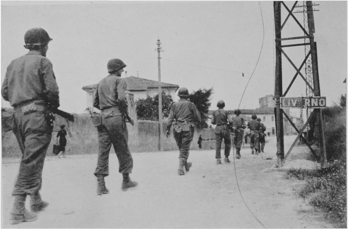
Outflanked on the east, Leghorn fell easily to men of the 34th Division.