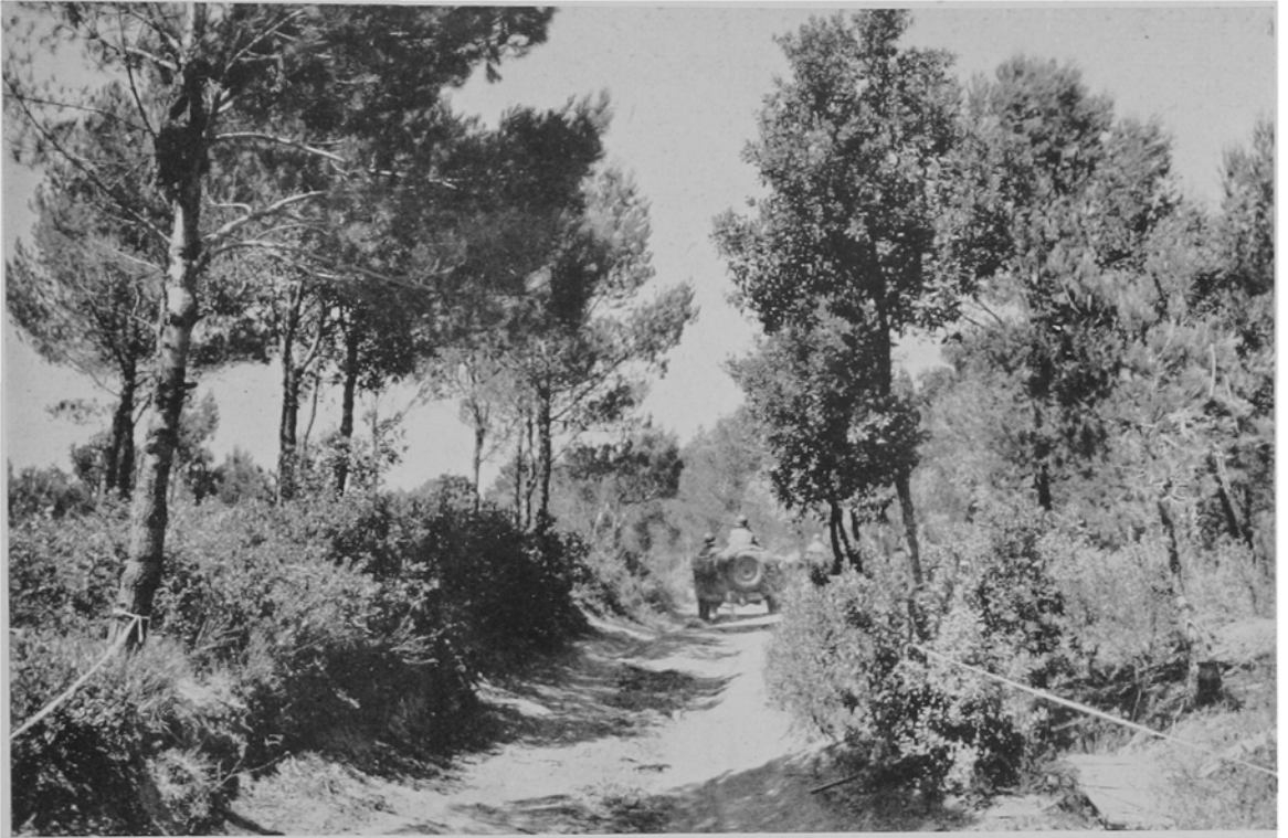
Over such roads as this contact was maintained between our columns.