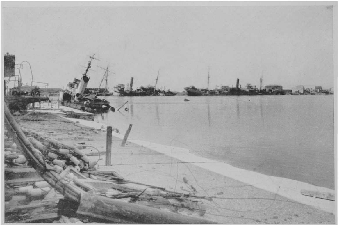
Leghorn harbor was mined and ships sunk everywhere to prevent its use.