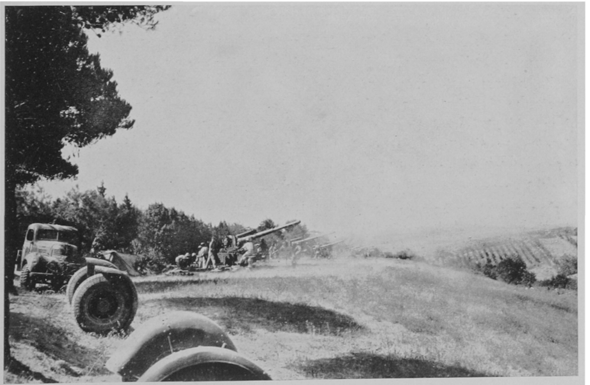
British antiaircraft guns supported the later stages of our drive.